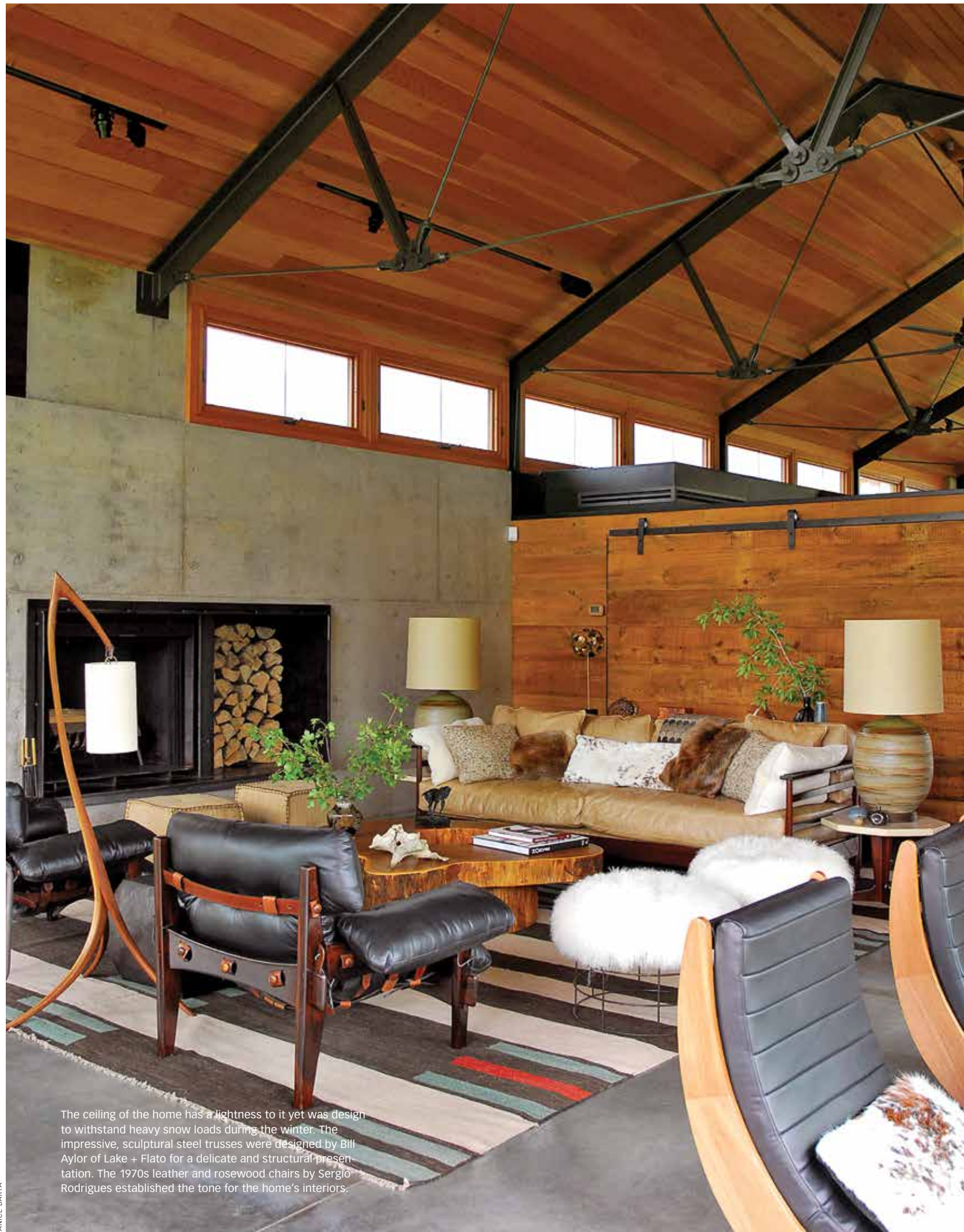
The ceiling of the home has a lightness to it yet was designed to withstand heavy snow loads during the winter. The impressive, sculptural steel trusses were designed by Bill Aylor of Lake + Flato for a delicate and structural presentation. The 1970s leather and rosewood chairs by Sergio Rodrigues established the tone for the home's interiors.